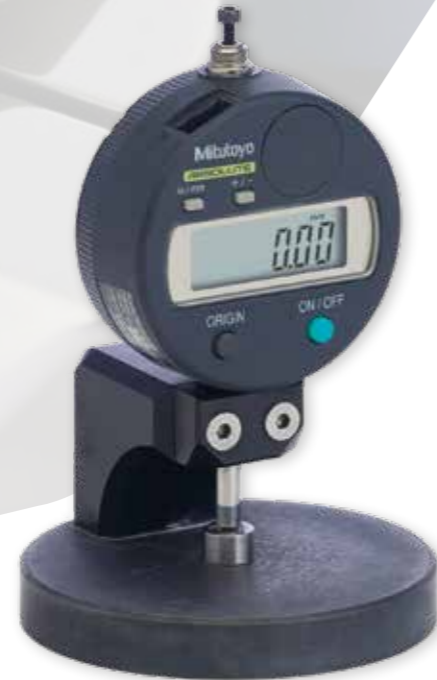
Mitutoyo Measuring Gauge

Alternatively, tablet weight and thickness can be entered into the TBF 100i system manually.