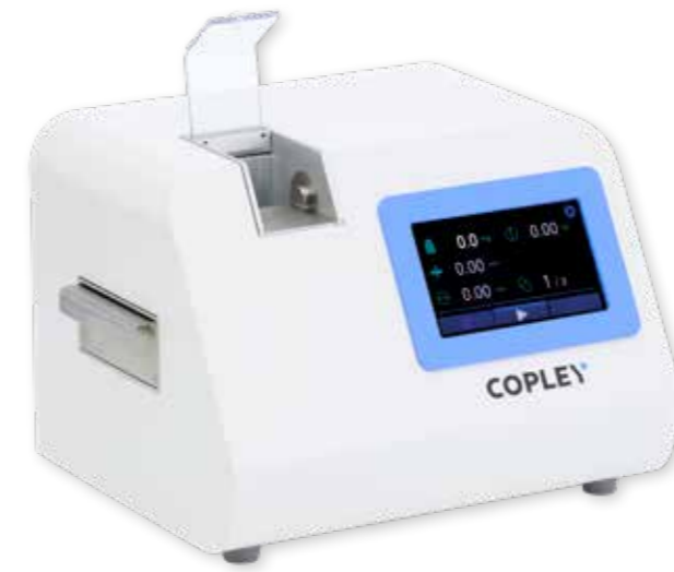
TBF 100i with open guard