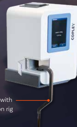
TBF 100i with calibration rig