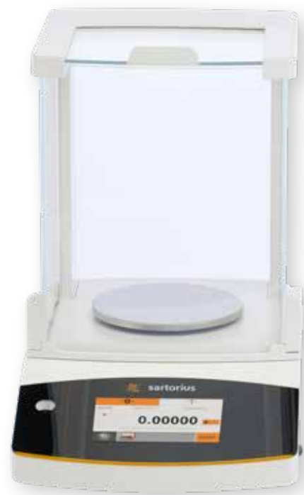
Sartorius Balance Model Quintix 224-1 CEU